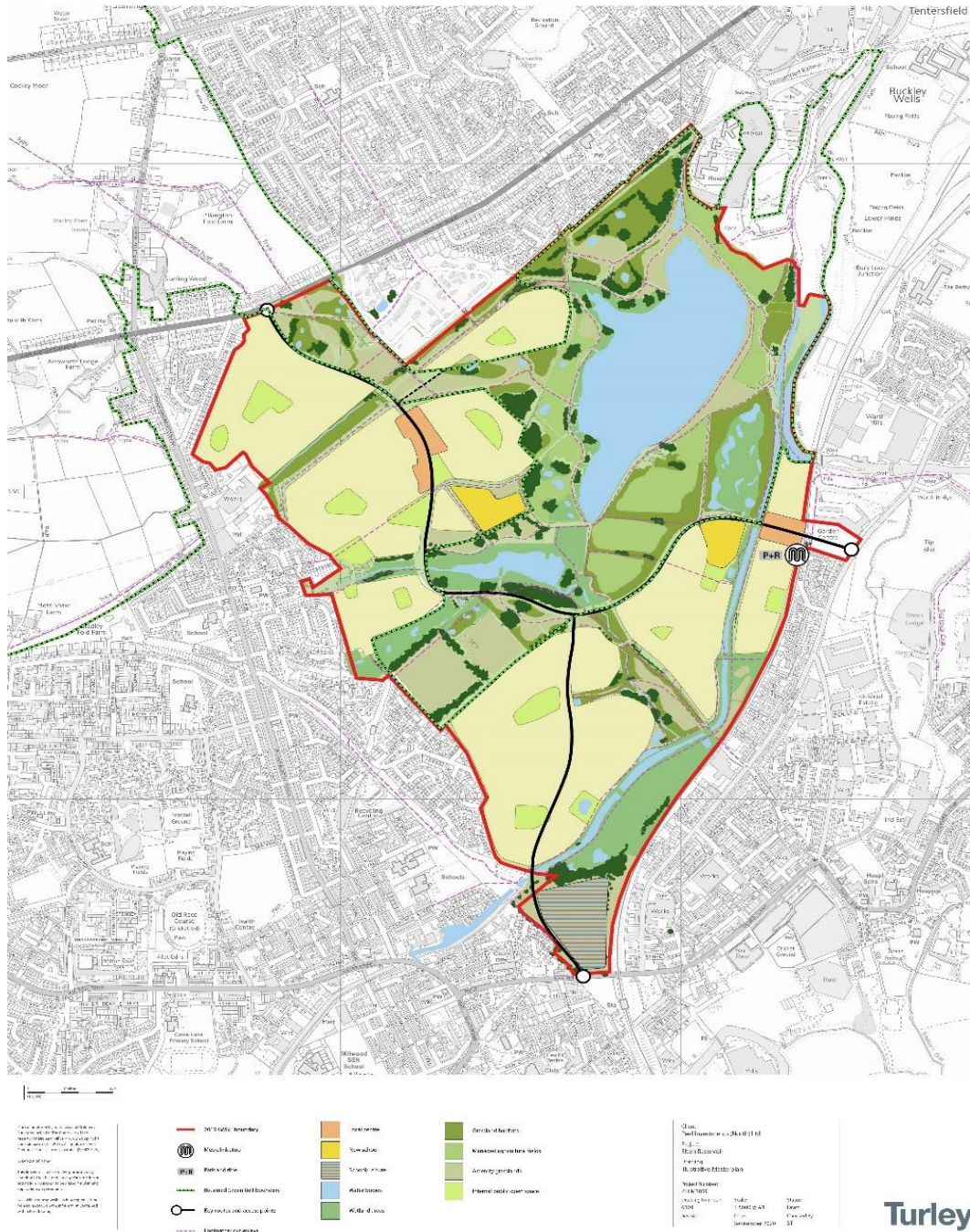
Figure 2 Elton Reservoir (JPA7) Illustrative Development Framework Plan